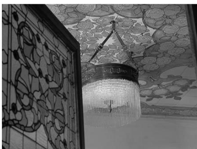
Institut Pere Mata